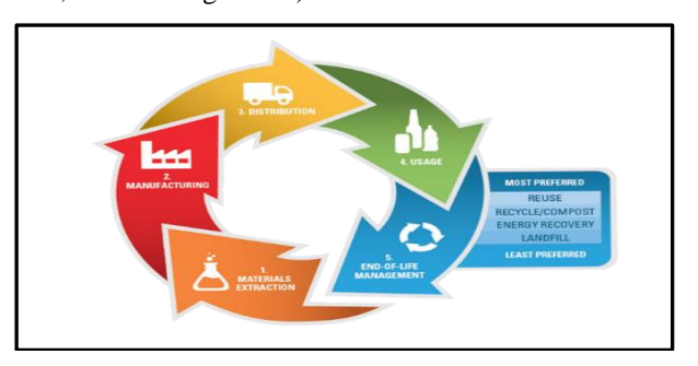
Figure 2. The Circular Economy Approach on Solid Waste Management

Potential avenues to look into are how the FIT-All funds are managed, the allocation or proportion for the types of RE and how close realized project financial metrics (IRR, NPV, PVR among others) to envisioned ones.