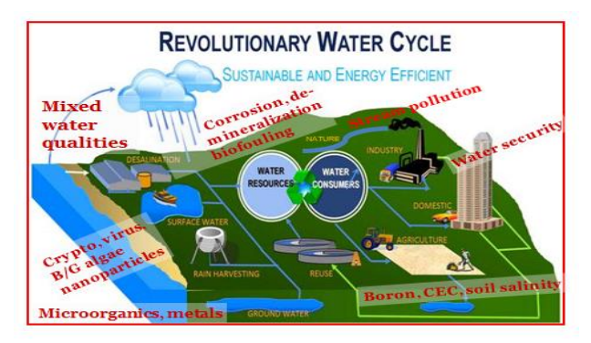
Figure 2. Water quality challenges and Drivers

Figure 2 depicts a variety of water quality challenges characterizing the water cycle described above. The drinking water quality, plus additional components resulting from its use, eventually dictates the quality of the wastewater generated by the water consumer. That