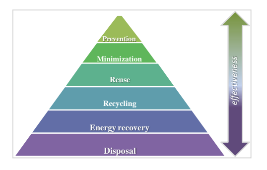
Figure 1: Hierarchy of waste management options

Among them focus is paid on developing methodologies for the recovery and/or generation of different types of carbon sources which could act as different precursors for the production of copolymers and blends with enhanced properties.